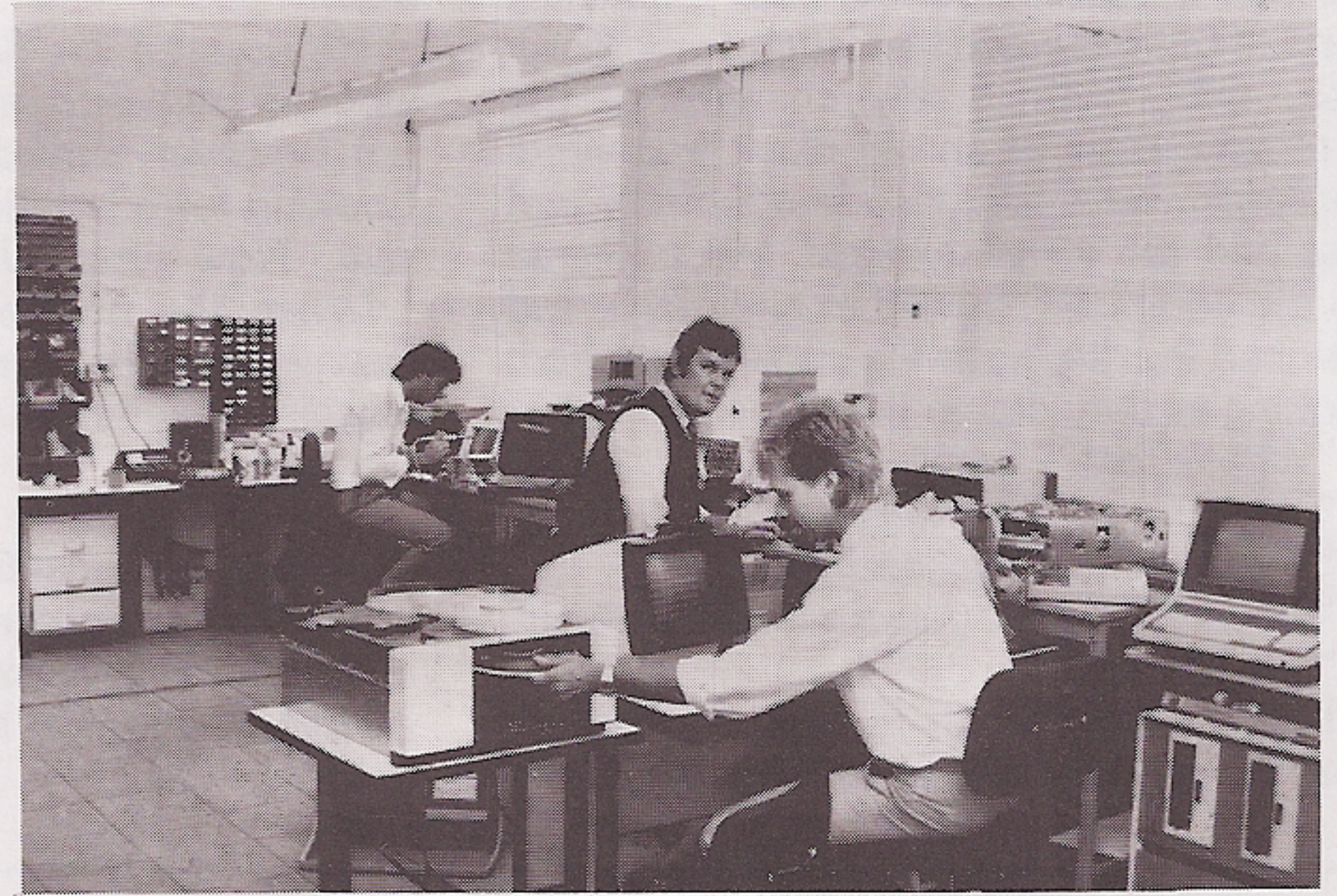
New Rework Center.