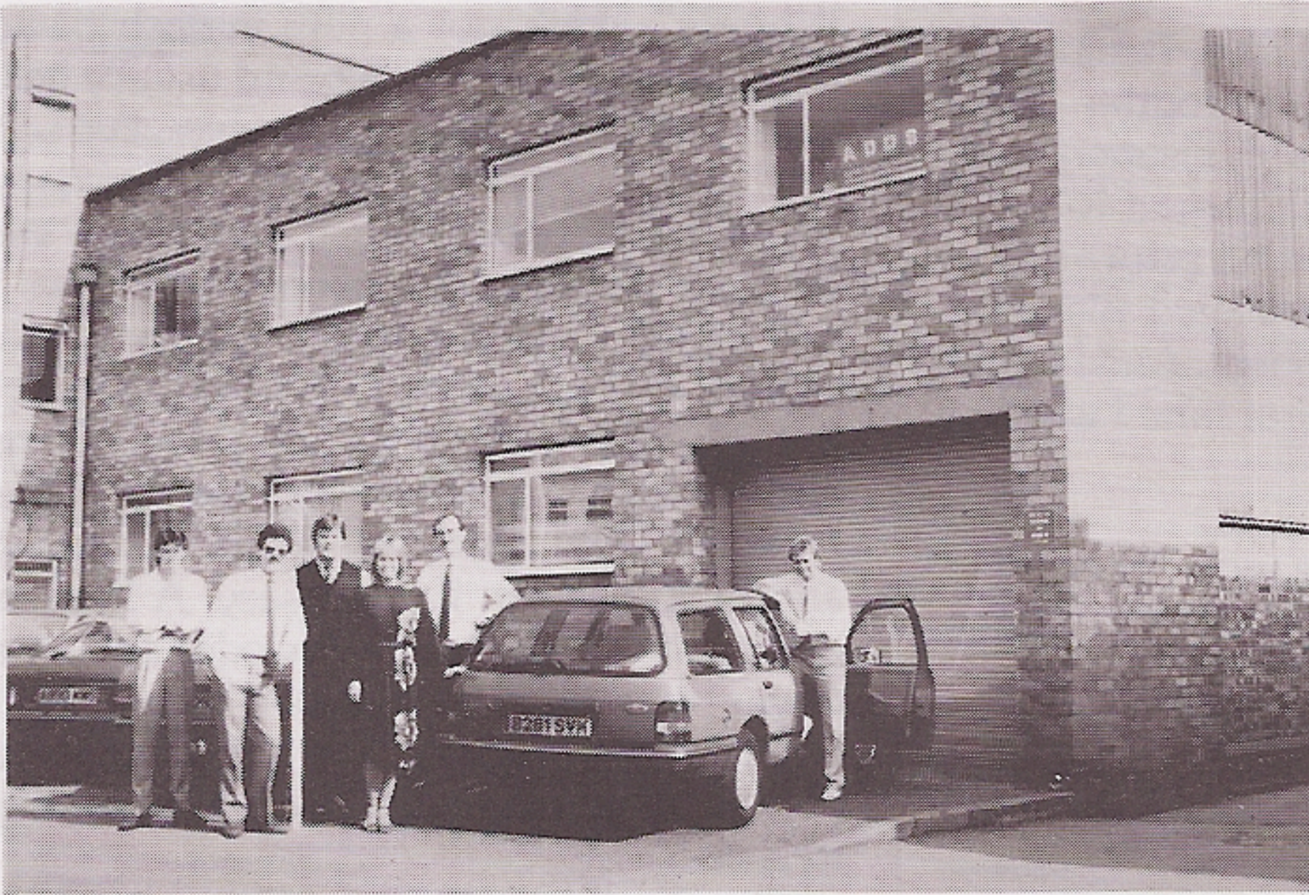
London office staff outside new building.

ADDS UK has a small but dedicated team of people in the UK office and things are moving ahead well. But we can always use some help. So, remember, the next time someone mentions England, tell them about us. They may be a customer one day!!